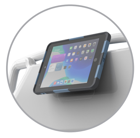
Clamp onto bed rails